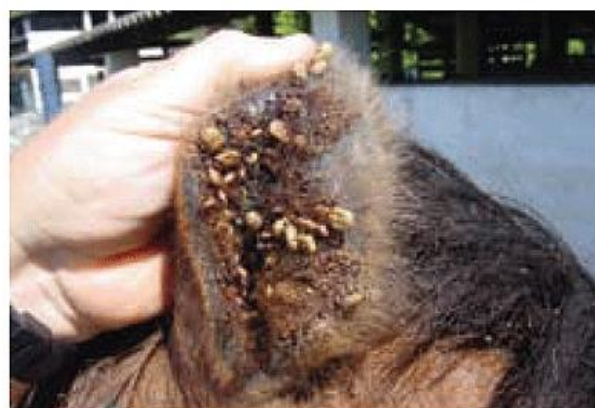
Ticks in a horses ear

Please follow the link http://www.bakermcveigh.com/capenewsletters.html to read the fifth of our monthly information sheets on ultrasonography.